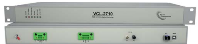
1U high, standard 19-inch Rack Mount Version