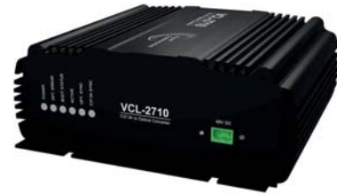
DIN Rail Mount Version